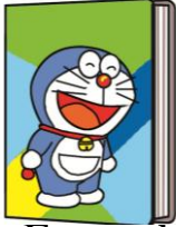
The Fox and the Crow

Doraemon The Story of Tam and Cam The Story of Mai An Tiem